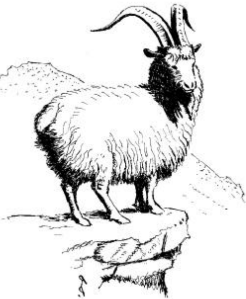
Kashmir Goat

At Redesmere we saw a man walking by the mere edge with a barn owl on his hand. It was obviously not a wild bird but one that had been rescued. Great to see none-the-less! At Carsington Water we once observed a juvenile marsh harrier from one of the hides. It was present for about two minutes. No one else recorded seeing it. At Carsington, in the mating season, we have seen lengthy battles between male coots and also between male mute swans. On the Tees in County Durham we have seen a pair of goosanders with an enormous brood of 15 youngsters. In Cumbria we observed a peregrine swoop at a song thrush and miss! In Northumberland from our car we have seen short-eared owls quartering fields.