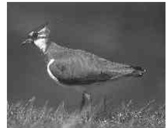
Lapwing Dove Tolliday

A strange category, I'll admit, but I had to mention the pair of pied wagtails that live in the centre of Wilmslow.