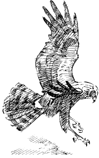
Hen harrier by John Busby

The well-known RSPB reserve at Blacktoft Sands seldom disappoints though we may not always see all the birds we expect there. This great area of reedmarsh and lagoons near the confluence of the Rivers Ouse and Trent is well known for hen and marsh harriers, bearded tits, hosts of wintering geese and lesser wildfowl and waders and much else. Outstanding today was a female marsh harrier quartering over the reedbeds and alighting at the reedbed edge, where it was closely approached by two inquisitive mallard. A female hen harrier and short-eared owl were seen and a few white-fronted geese and spotted redshanks were found by the Ousefleet hide area. Other observations included small numbers of teal, up to 50 wigeon, little grebe, shelduck, various greylag geese, dunlin, a common snipe, golden plover and over 500 lapwings - many at rest on adjacent fields. Reed buntings and tree sparrows were on nearby hedgerows.